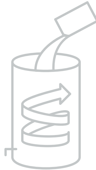
Pour WildBrew Helveticus Pitch™ into unhopped wort